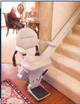
ELECTA-RIDE™ ELITE Model SRE-2010

Home accessibility solutions and automotive products