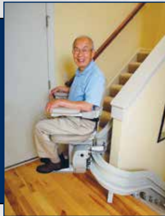
ELECTA-RIDE™ III Model CRE-2110