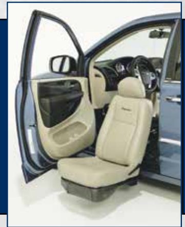
VALET™ SIGNATURE SEATING