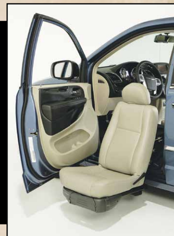
VALET® SIGNATURE SEATING

Founded over 25 years ago, Bruno Independent Living Aids, Inc., is a world-wide manufacturer of accessibility products designed to enhance the lives of those challenged by limited mobility. In pursuing this goal, Bruno is proud to be the only U.S. manufacturer of indoor/outdoor stairlifts, interior/exterior scooter, powerchair and wheelchair vehicle lifts and Valet® Signature Seating products to be ISO 9001 Certified. This is one of the most stringent, widely-recognized quality standards in the world and your assurance that Bruno is committed to providing you with the highest-quality, most reliable products in the industry. Ask your certified Bruno dealer for details on all Bruno independence products.