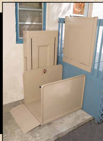
VERTICAL PLATFORM LIFT Model VPL-3100