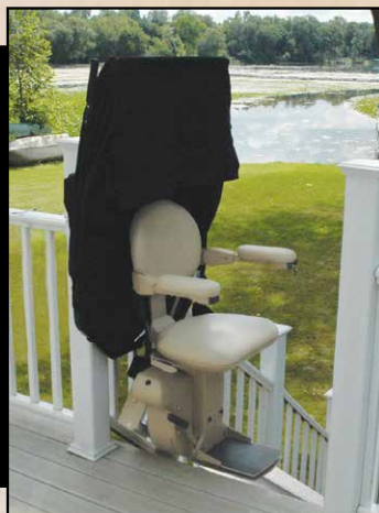
OUTDOOR ELITE Model SRE-2010E The only 400 lb/181.8 kg capacity outdoor stairlift... an INDUSTRY EXCLUSIVE!

Home accessibility solutions and automotive products