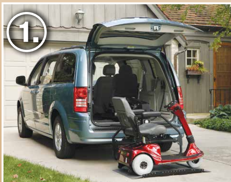
Power platform down & drive on...