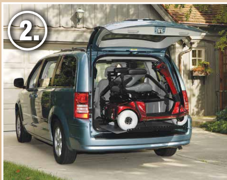
Raise platform and secure the belts...