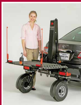
CHARIOT® VEHICLE LIFT