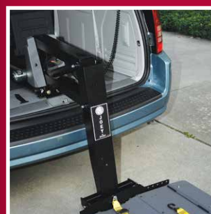
Vehicle Specific Mounting Kits (Some applications require upcharge)