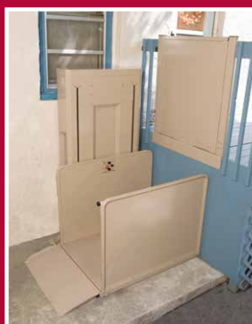
VERTICAL PLATFORM LIFT