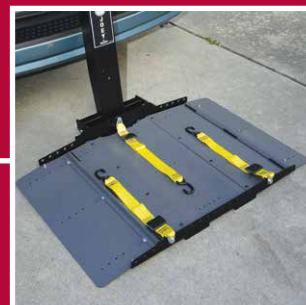
One Hand Operation Securement Belts