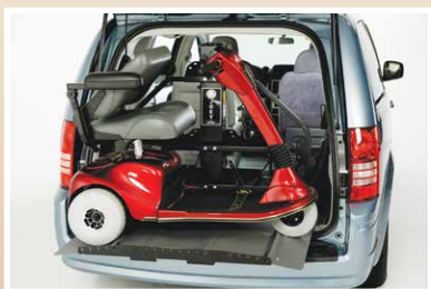
Three or Four Wheeled Scooters