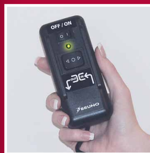
One Button Hand-Held Pendant with Indicator Light