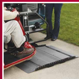
Easy Drive On/Drive Off Platform From Either Side