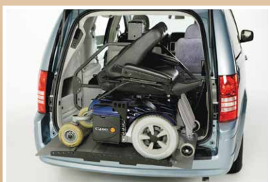
Front-Wheel/Rear-Wheel Drive Powerchairs