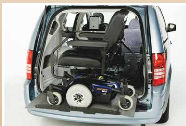
Mid-Wheel Drive Powerchairs