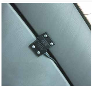
Door Safety Switch