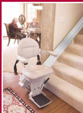
ELITE STRAIGHT RAIL STAIRLIFT