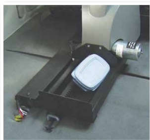
Obstruction Sensing Safety Plate