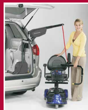
CURB-SIDER® VEHICLE LIFT