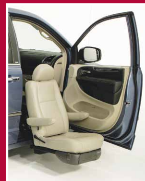
VALET® SIGNATURE SEATING