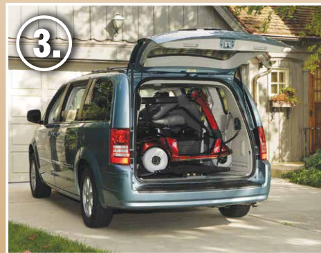
Power platform into the vehicle.