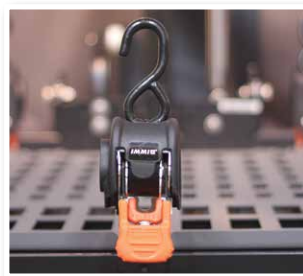
Retractable Belts Option (For use with or without Barrier)